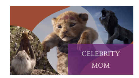
<u>Disney Releases First-ever 'Lion</u> <u>King' Live-action Teaser</u>