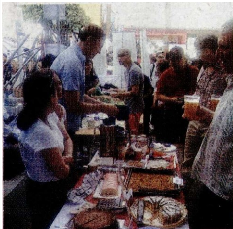
POPULAR German sweets were also available at the fair.

Mabuhay Germany 2015 is organized by the German-Philippines Chamber of Commerce and Industry, in cooperation with the German Embassy, Goethe Institut, and the German European School Manila, to celebrate over 60 years of diplomatic relations between the two countries.