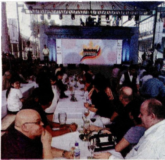
GUESTS were treated to a feast of German goodies.