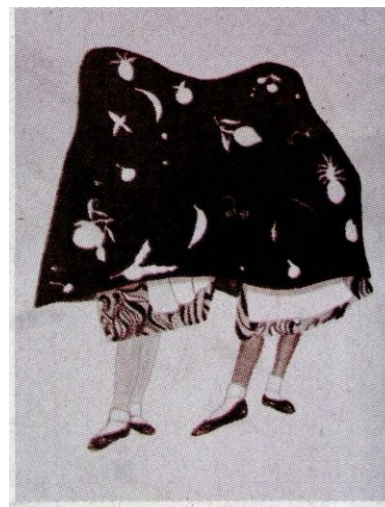
Delight In One's Sorrow

The seduction, the fascination, and the charm of it all—that is the very appeal of the artworks in Nile Pobadora's "Time Lapse." He uses ink and acrylic to draw, on paper, photographs sourced from a neighbor's cache of old photographs intended to be thrown away. He used muted wash of gray and inky black to show the fading details and a blue ballpoint pen for the figures, making the images stranger, distanced, and seemingly afloat somewhere between here and now. "Time Lapse" will run from June 12 to July 4 at the Cendrar C-11 South of Market Bonifacio Global City, Taguig 1634, 63 917 6541515, www.pablogalleries.com